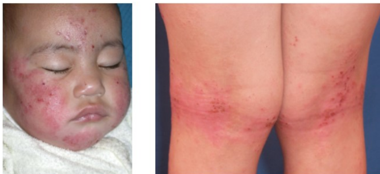
Figures: Atopic Dermatitis Lesions