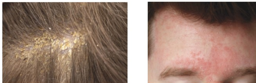
Figures: Seborrheic Dermatitis

Seborrheic dermatitis is a common skin disease that is estimated to occur in more than 10 million people in the United States. The disease causes red patches covered with large, greasy, flaking yellow-gray scales, and is frequently itchy. It appears most often on the scalp, face (especially on the nose, eyebrows, ears, and eyelids), upper chest, and back as depicted in the figure below. A milder variant of the disease is dandruff. While the pathogenesis of seborrheic dermatitis is not well understood, some experts believe a contributor is an over-abundance of Malassezia , a naturally occurring yeast found on normal skin but found in excess numbers on skin with seborrheic dermatitis. There also is an immunological or inflammatory component, possibly as a result of the proliferation of the Malassezia yeast and its elaboration of substances that irritate the skin. Seborrheic dermatitis can occur in both adults and infants, and in infants is commonly referred to as "cradle cap".