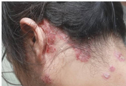
Figures: Scalp Psoriasis