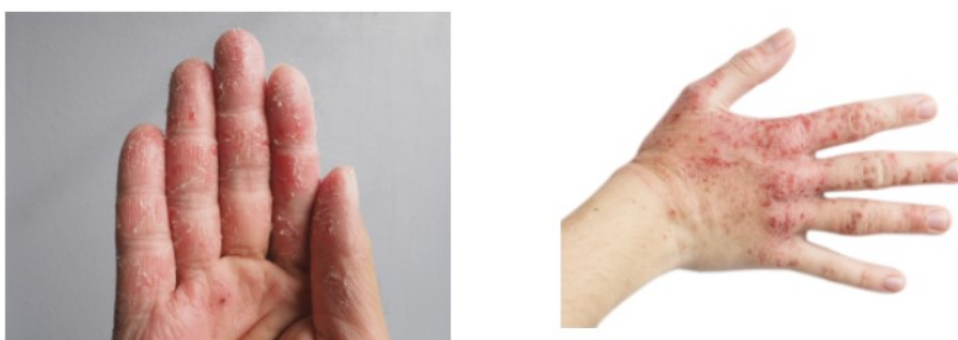
Figures: Hand Eczema

Hand eczema is a common, predominantly inflammatory, skin disease characterized variously by redness, fluid filled blisters or bumps, scaling, cracking, itching and pain occurring on the hands, especially the palms (see figures below). It is the most common skin disease affecting the hands, with prevalence estimated at up to 2.5% of the population. The impact of hand eczema on patients can be significant, leading to work absences or disability, social stigmatization, and psychosocial distress.