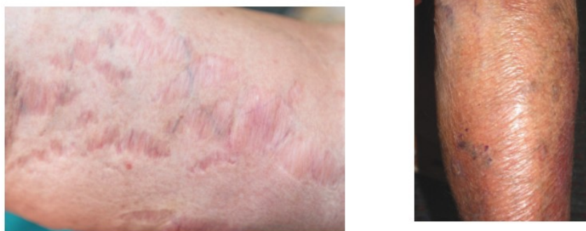
Figures: Steroid-induced striae (left) and Steroid-induced skin atrophy (right)