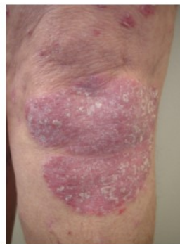
Figures: Plaque Psoriasis